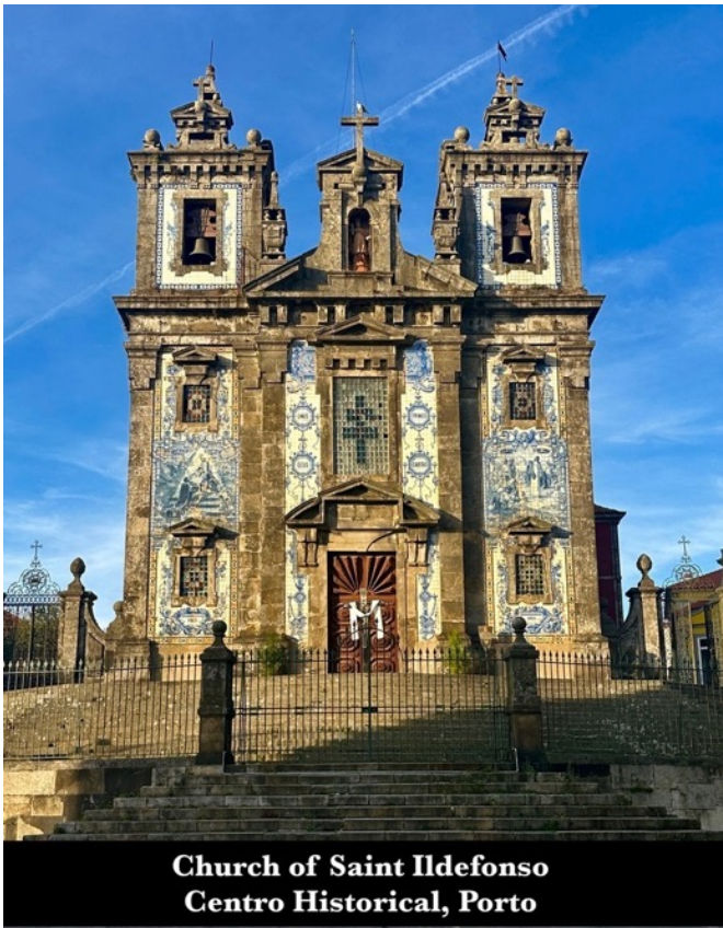
Church of Saint Ildefonso Centro Historical, Porto

finer aspects of recreation and relaxation perfectly. Guests can always find something to do, whether it's a workout with a personal trainer, relaxing in a Turkish bath or just finding a quiet corner or cozy nook on the property to sit and read. The staff is welcoming, always helpful, and more than willing to offer suggestions. Even the short walk on the raised walkways that lead to the beach is pleasurable and if you are not ready to be water active, you can easily find a comfy place in the sand to be "inactive" and just enjoy the breeze, the sun, and the smiling faces of the people you'll meet on the beach. That, in and of itself, is worth a visit to the beach.